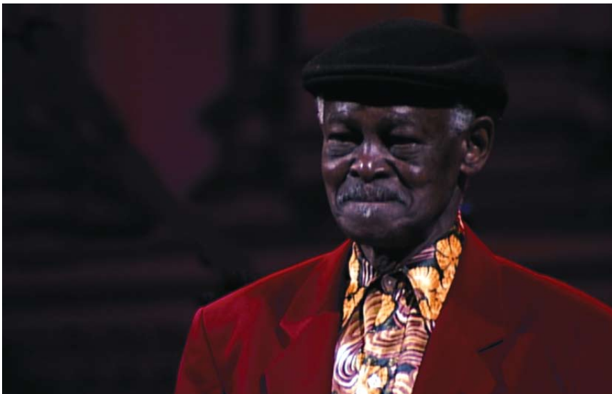
~ Ibrahim Ferrer ~