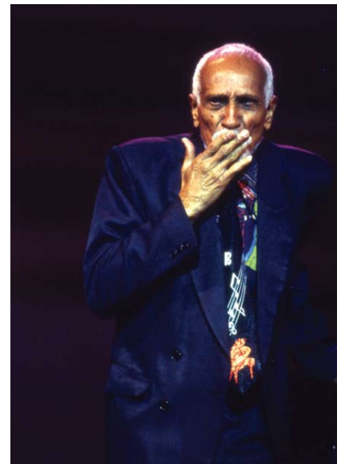
~ Rubén González ~

Barbarito Torres "I tried playing it behind my back with Juan de Marcos as a joke. Then during the soundcheck he said 'Let's put it in the show'. I said 'No, it's ridiculous'. But he said 'Yes, it's good, people will love it'. And he was right. The audiences in Amsterdam and in New York loved it and I've been doing it ever since!"