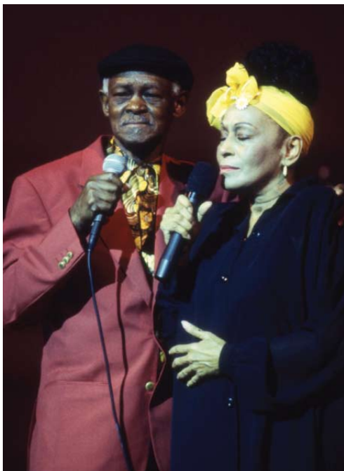
~ Ibrahim Ferrer & Omara Portuondo ~